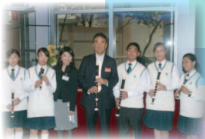
A performance from the recorder group at the tea reception