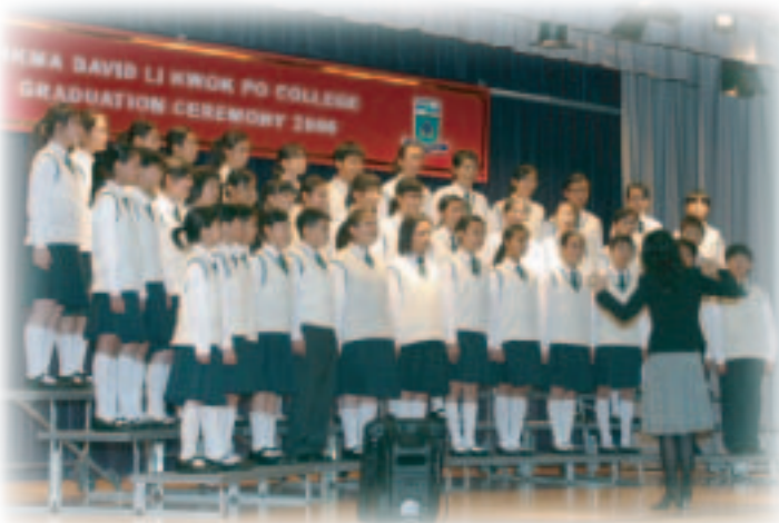
The School choir has been preparing for this performance for months; their hard work paid off!