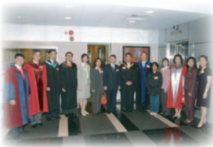
The Officiating Party with members of our PTA