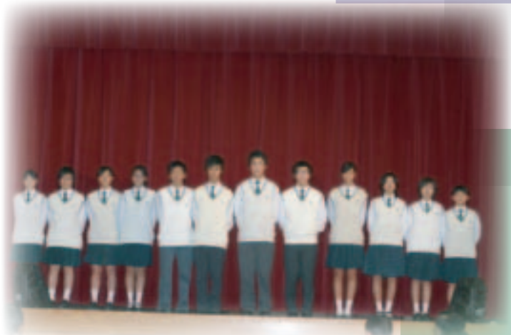
A group of senior form students recite the Rudyard Kipling poem, 'If'.